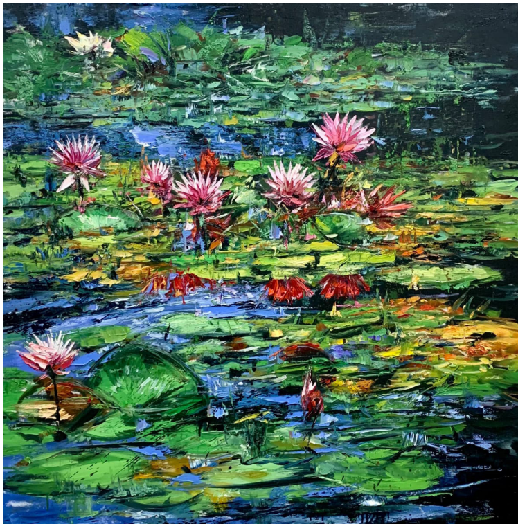
RED WATER GARDEN 01 (2021)

The water lilies call my attention a lot because they are quite peculiar gardens. usually gardens are planted on the earth and man must work and maintain them. The lily gardens are born alone and are gardens in the water, in fact, they are the only gardens existing outside of the ground! I find this very interesting, in addition to the peace and tranquility that they transmit both while I am creating them and when they are finished."