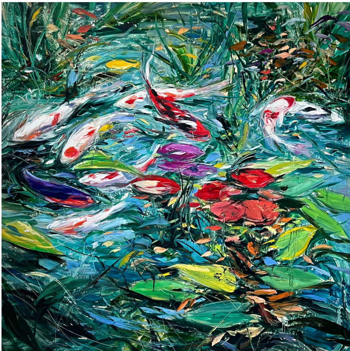
THE TURQUOISE COLOR, 2022.