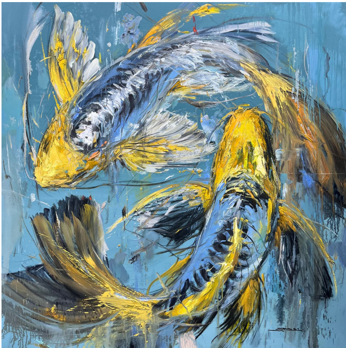
DANCING 2, 2021.