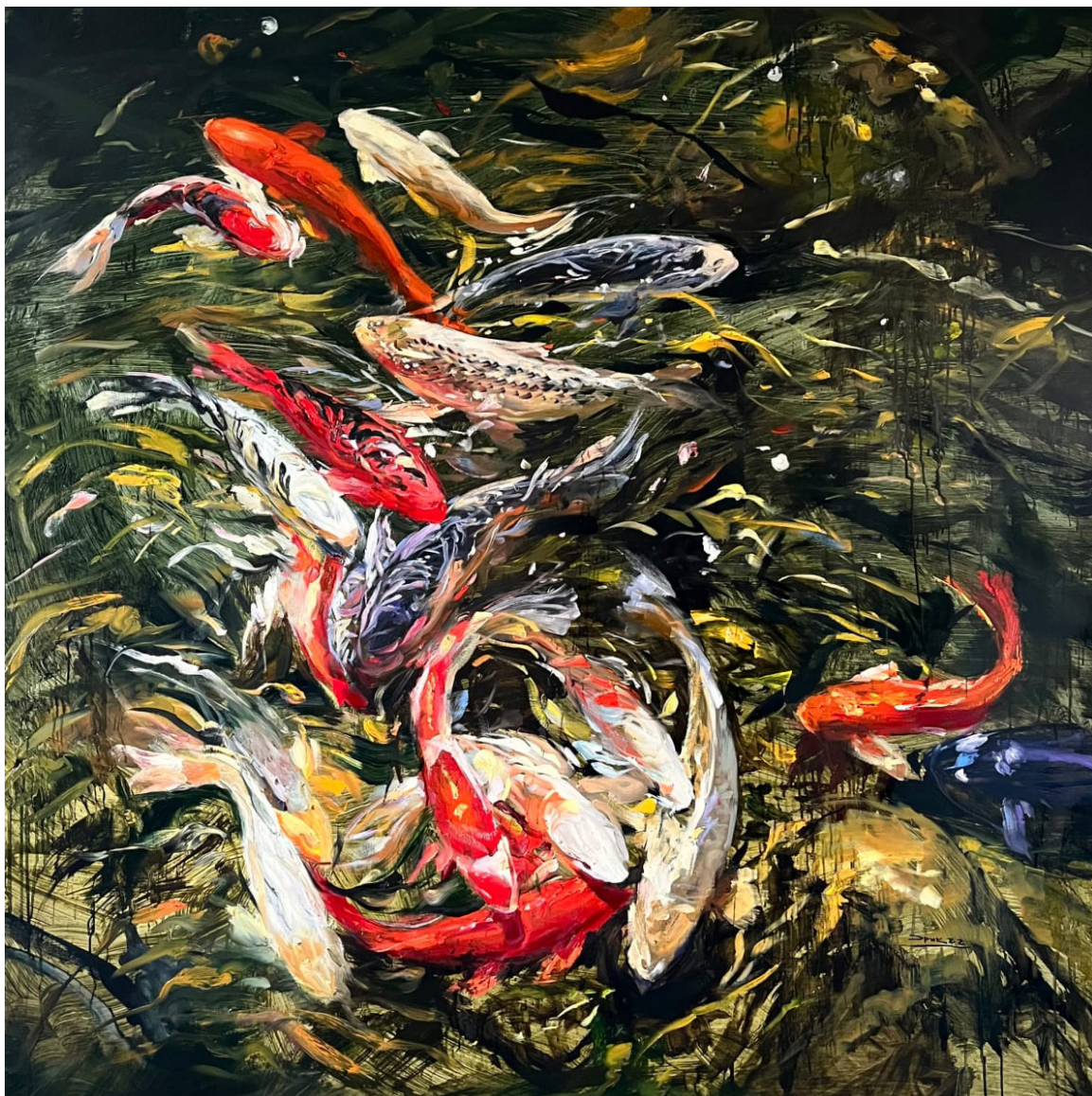
THE AFTERNOON LIGHTS, 2022. 60 x 60 inches - Oil on Canvas