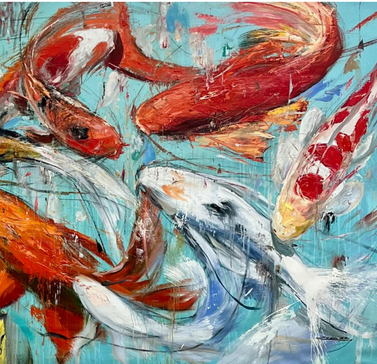
THE KOIS AQUARIUM, 2022. 60 x 128 inches - Oil on Linen