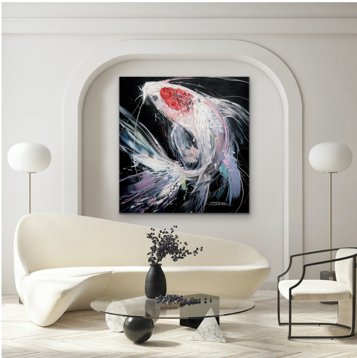
TANCHO KOI, 2022.