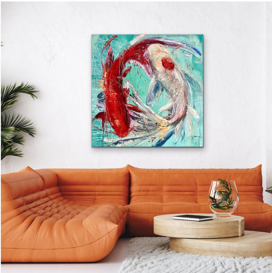
ICE AND FIRE, 2022. 48 x 48 inches - Oil on Canvas