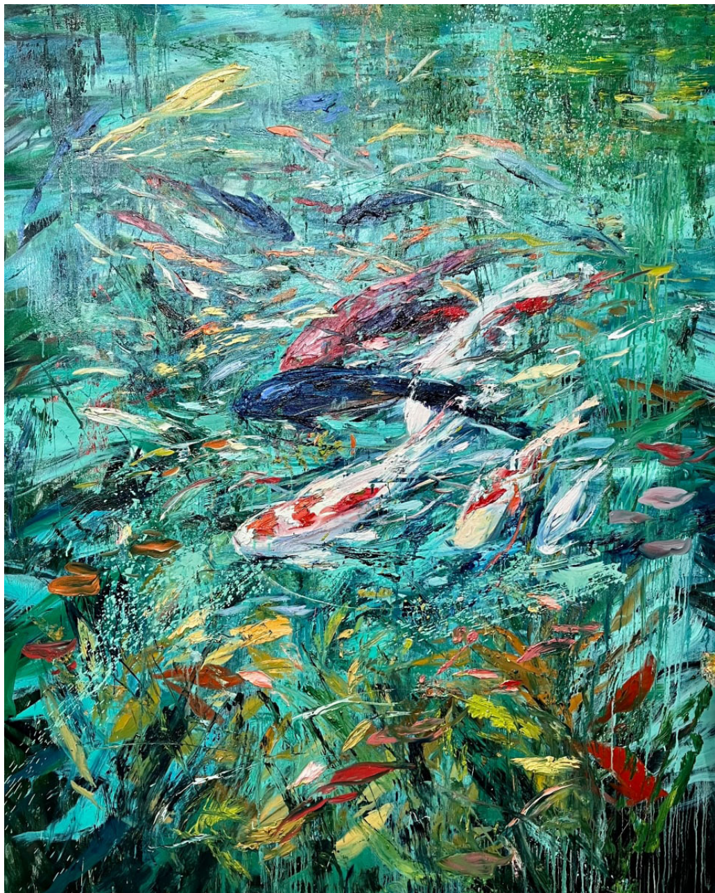
TURQUOISE WATERS 03, 2022.