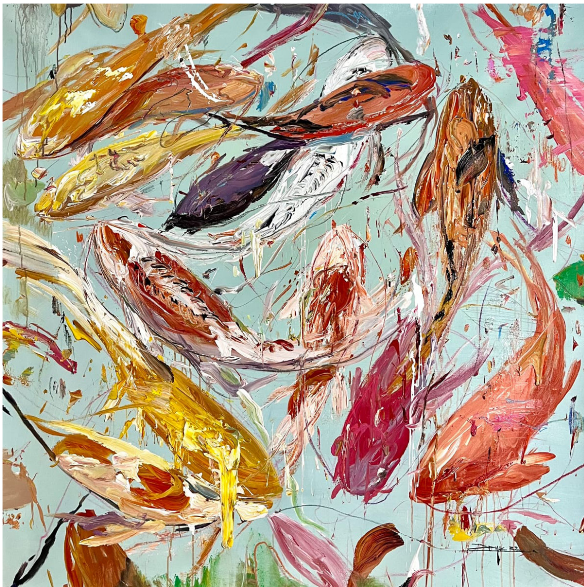
THE FAMILY, 2022.