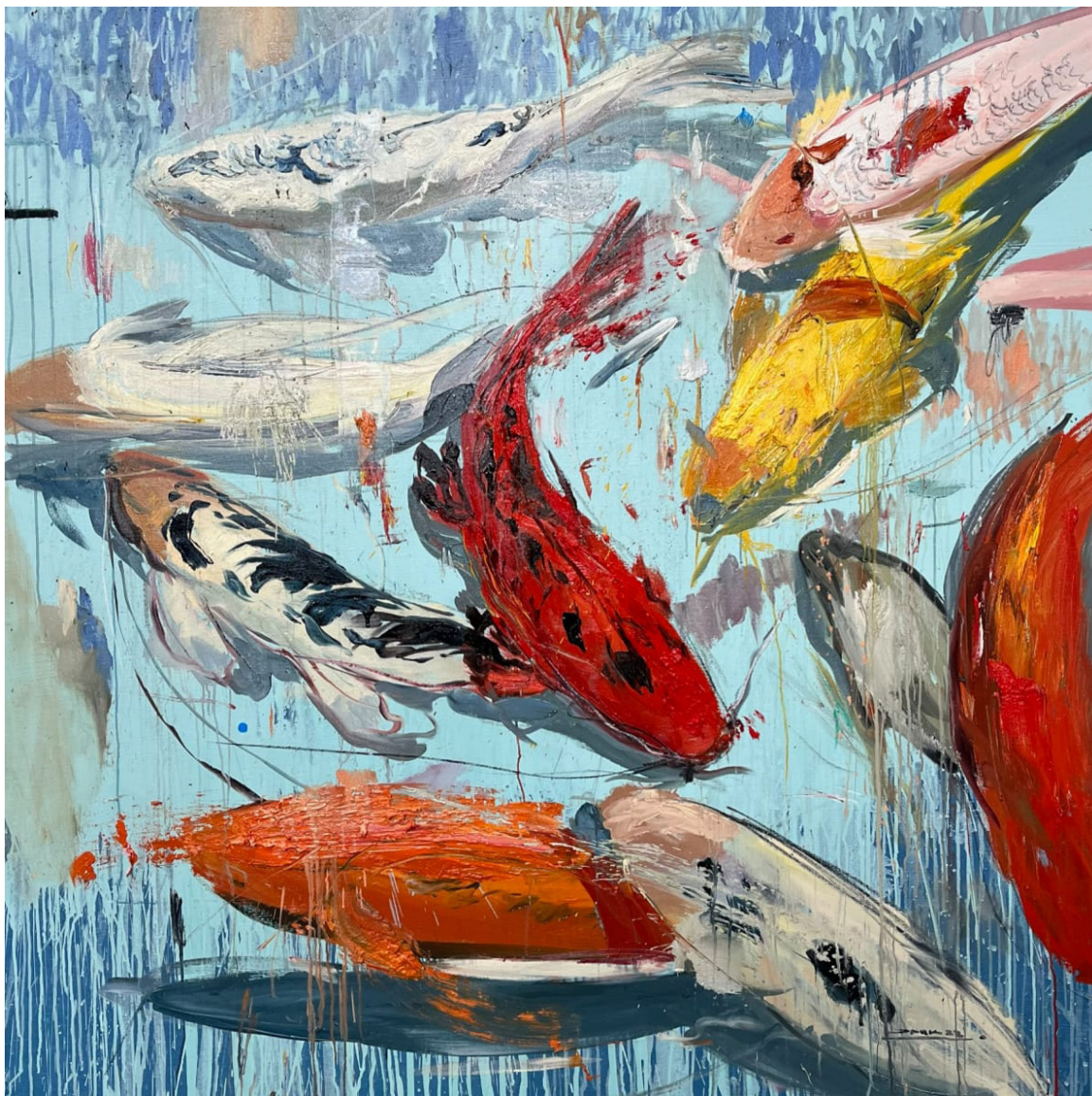
THE SPECIES, 2022.