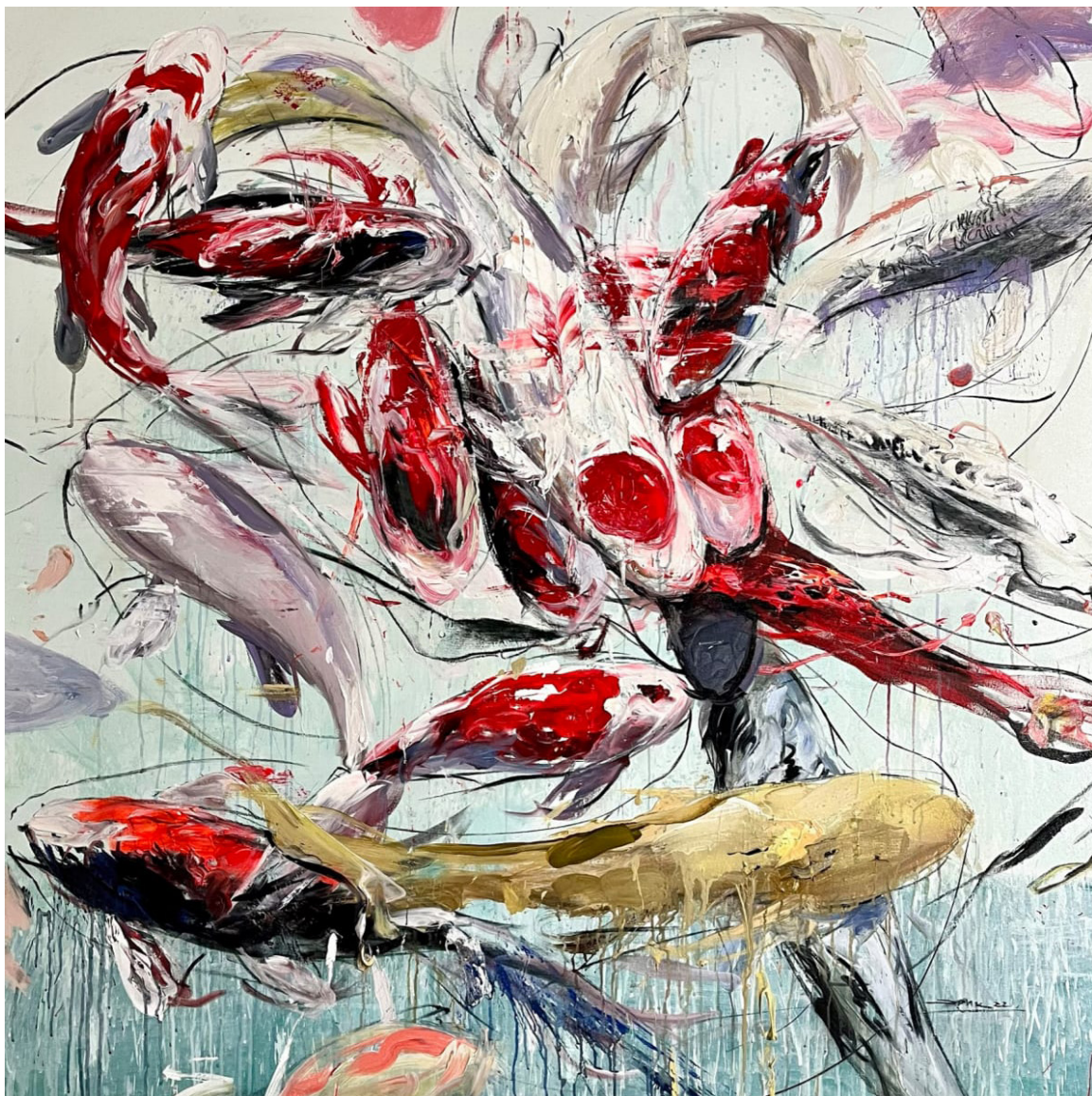
DANCE 02, 2022.